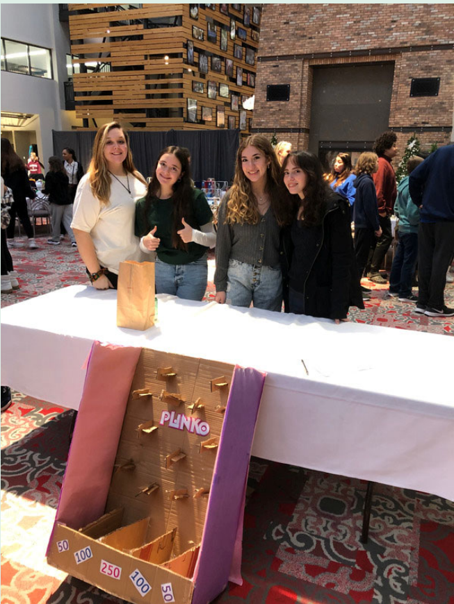
These Lake Shore students are at Rich's Atrium for the CSETI Cardboard Arcade Challenge. They won the award for Most User-Friendly product.